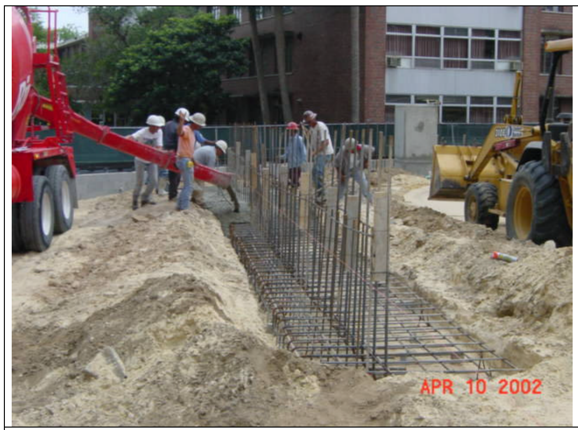
Const. Yard Fnd..JPG