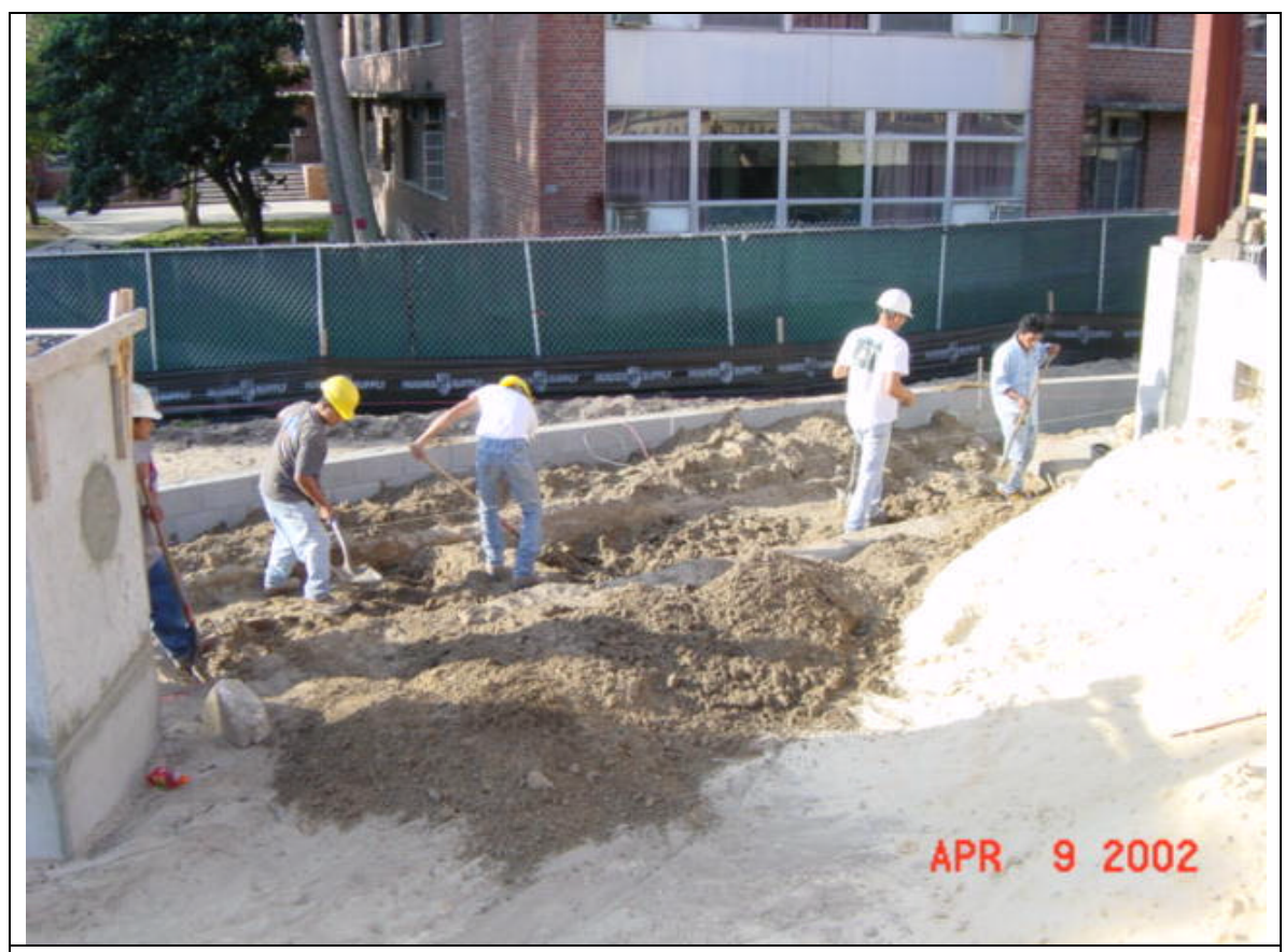
Excavation for Const. Yard Fnd..JPG