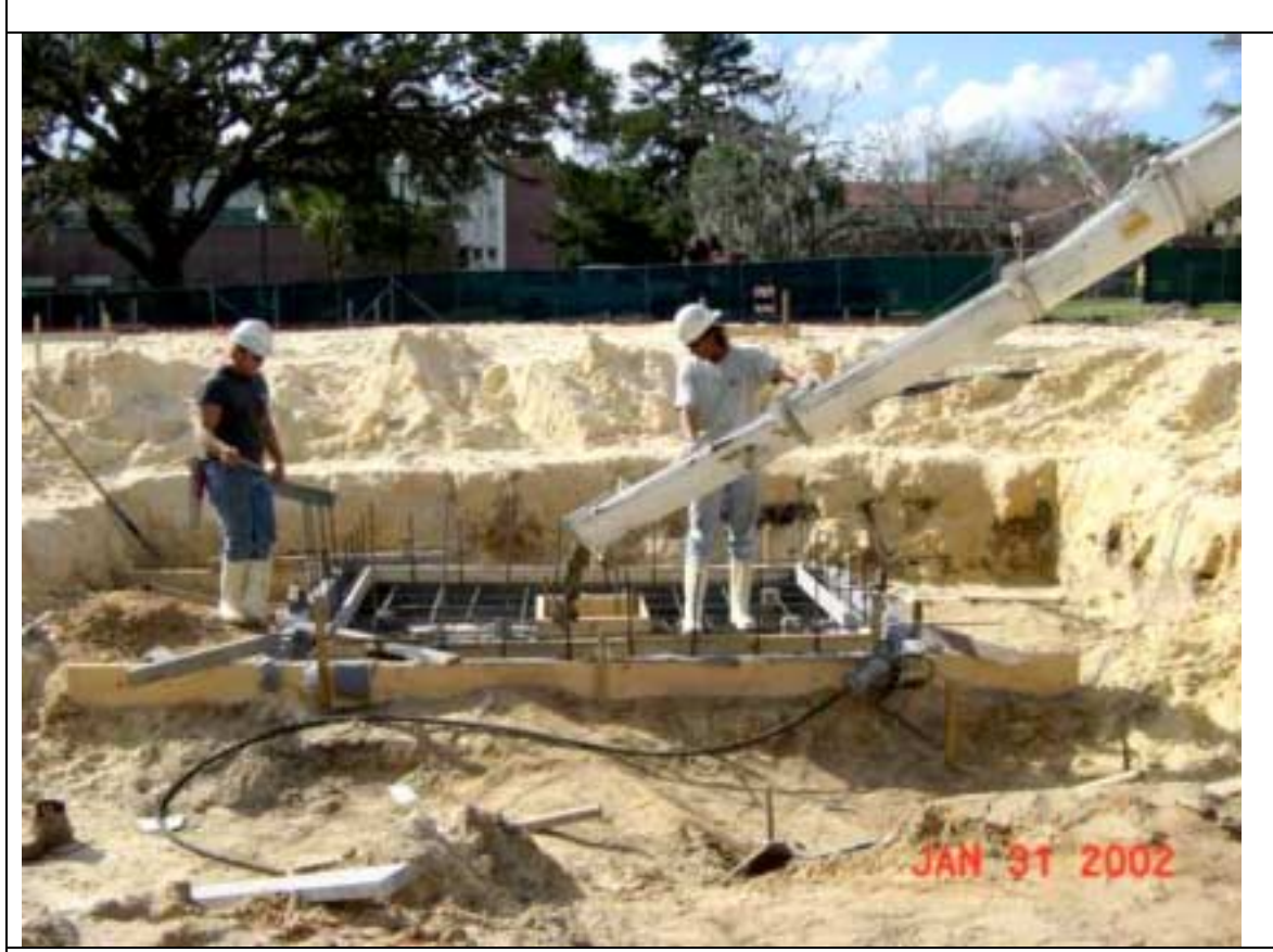
Placing concrete for the elevator pit.