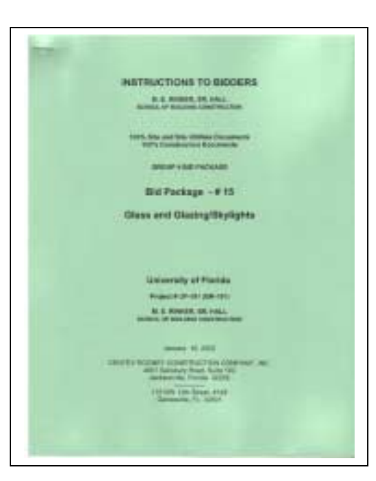
Instructions to Bidders Book Issued for each Bid Package