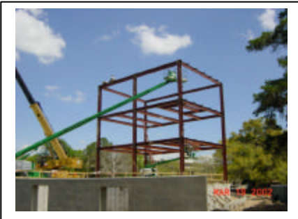
Steel Erection Beginning at K line