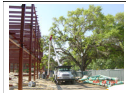
UF Tree Trimming