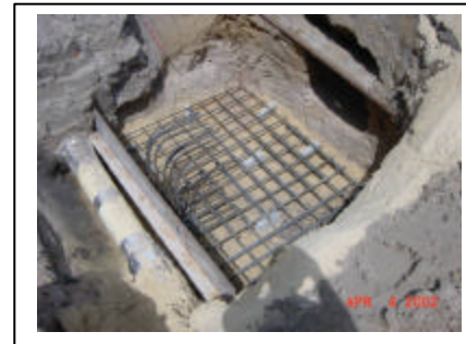
A-2 Foundation Pad