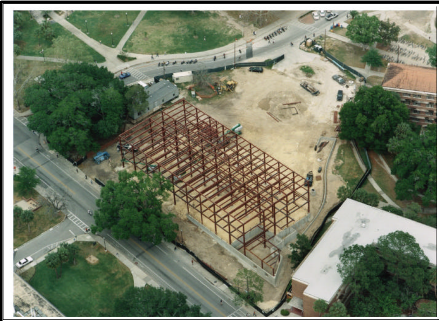
Aerial Photograph Dated April 3, 2002