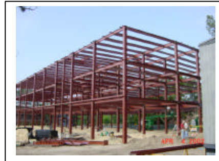
Structural Steel thru B line