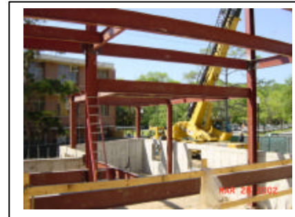
Steel Erection at Mechanical Room