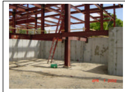
Mechanical Room Beams