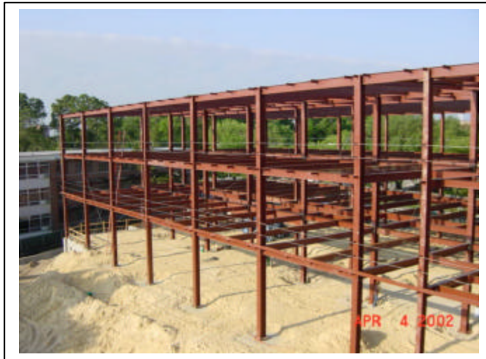
Trinity Fabricators has erected the columns and beams between B and M lines.

Structural Steel: Trinity Fabricators mobilized and erected the structural steel columns and beams from column line M at the mechanical room to column line B. Erection had to be postponed between column line B and the A-2 foundation pad due to the steam conflict encountered at this foundation pad. Trinity Fabricators has begun installing slab edge angles and performing the required welding work.