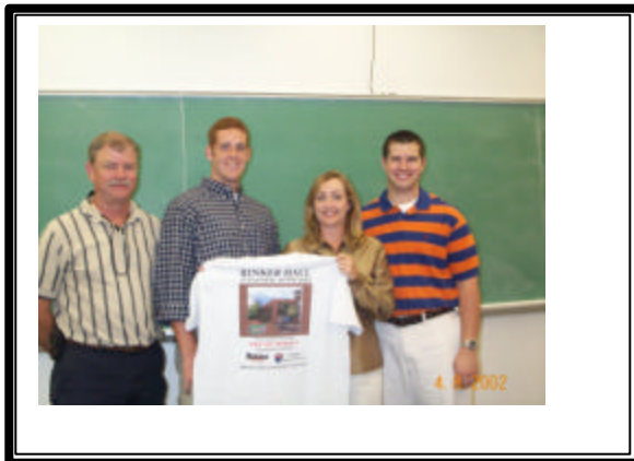
Winning T-Shirt Design