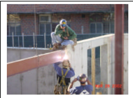
Welding at Plate Embed