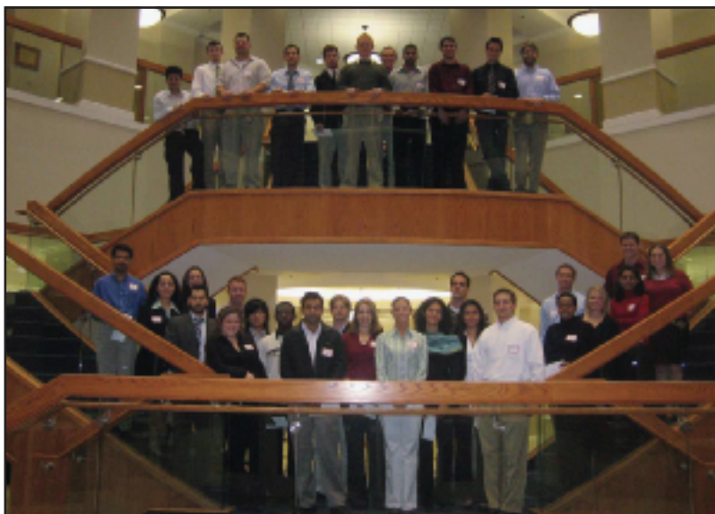
2006-2007 BCN Scholarship Recipients