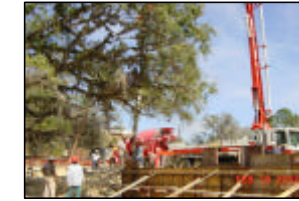
[Picture taken 2.19.02]

2.20.02 >Group 5 pre-bid conferences held at CRCC jobsite trailer for roofing.