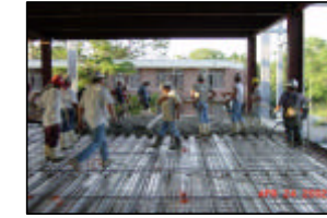
[Picture taken 5.01.02]